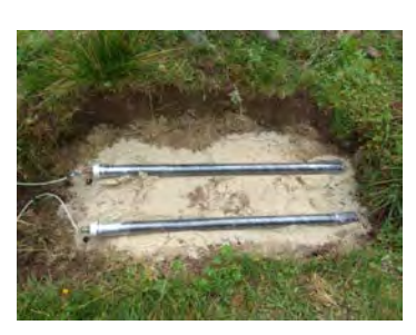
LEMI-152 in field